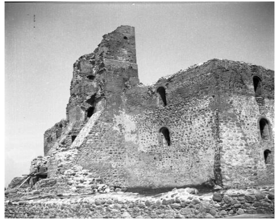
Trakai residential Castle in 1954 before restoration.

Photos of archaeological sites, monuments and historical landscape covers classical archaeological sites of the Stone, Bronze and Iron Ages, the major sites of Lithuanian Middle Ages (13th-16th): the Grand Duke's Palace and Lower Castle in Vilnius, Kaunas Castle, Residential Castles in Trakai, etc. Panoramic photos also preserved the unique cultural landscape of our country, which has now ceased to exist.