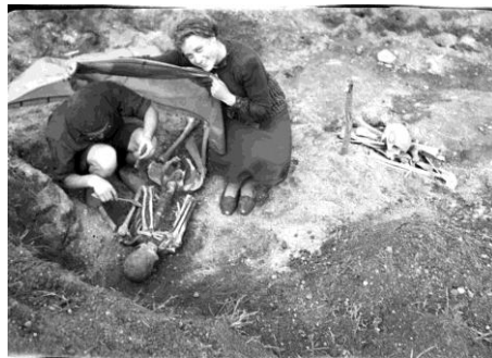
excavation in 1949.

Photos of archaeological investigations reveals the development of archaeological history and major archaeological sites which were excavated in 1948-1969. Images shows expedition every day life, methods and tools that were used by archaeologists in the middle of 20 th century and furthermore – feature the most famous Lithuanian archaeologists.