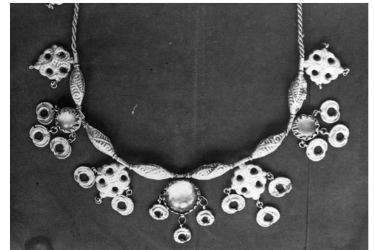
Silver necklace found in 1950 (site unknown).

Photos of archaeological findings – another major part of the collection. Here you can see rare and exclusive archaeological artifacts collected from graves, mounds, castles, settlements and other archaeological sites.